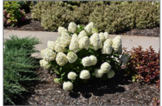
Little Lime Punch Hydrangea in bloom

Little Lime Punch Hydrangea makes a fine choice for the outdoor landscape, but it is also well-suited for use in outdoor pots and containers. With its upright habit of growth, it is best suited for use as a 'thriller' in the 'spiller-thriller-filler' container combination; plant it near the center of the pot, surrounded by smaller plants and those that spill over the edges. It is even sizeable enough that it can be grown alone in a suitable container. Note that when grown in a container, it may not perform exactly as indicated on the tag - this is to be expected. Also note that when growing plants in outdoor containers and baskets, they may require more frequent waterings than they would in the yard or garden. Be aware that in our climate, most plants cannot be expected to survive the winter if left in containers outdoors, and this plant is no exception. Contact our experts for more information on how to protect it over the winter months.