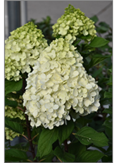
Little Lime Punch Hydrangea flowers

Little Lime Punch Hydrangea is recommended for the following landscape applications;