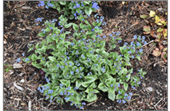
Queen of Hearts Bugloss in bloom

Queen of Hearts Bugloss will grow to be about 18 inches tall at maturity extending to 30 inches tall with the flowers, with a spread of 3 feet. When grown in masses or used as a bedding plant, individual plants should be spaced approximately 30 inches apart. It grows at a medium rate, and under ideal conditions can be expected to live for approximately 10 years. As an herbaceous perennial, this plant will usually die back to the crown each winter, and will regrow from the base each spring. Be careful not to disturb the crown in late winter when it may not be readily seen!