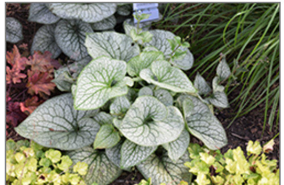
Queen of Hearts Bugloss foliage