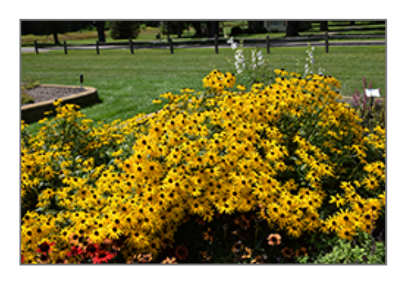
Glitters Like Gold Coneflower in bloom

This is a relatively low maintenance plant, and should be cut back in late fall in preparation for winter. It is a good choice for attracting butterflies to your yard, but is not particularly attractive to deer who tend to leave it alone in favor of tastier treats. It has no significant negative characteristics.