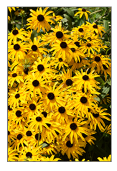
Glitters Like Gold Coneflower flowers

Glitters Like Gold Coneflower is an herbaceous perennial with an upright spreading habit of growth. Its medium texture blends into the garden, but can always be balanced by a couple of finer or coarser plants for an effective composition.