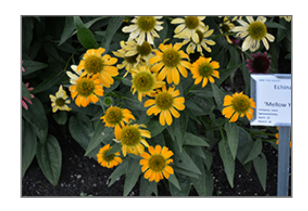
Mellow Yellows Coneflower flowers

Mellow Yellows Coneflower is recommended for the following landscape applications;