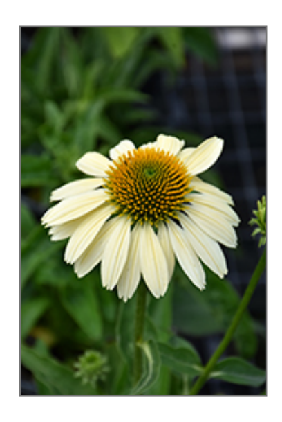
Mellow Yellows Coneflower flowers

This is a relatively low maintenance plant, and is best cleaned up in early spring before it resumes active growth for the season. It is a good choice for attracting birds and butterflies to your yard, but is not particularly attractive to deer who tend to leave it alone in favor of tastier treats. It has no significant negative characteristics.