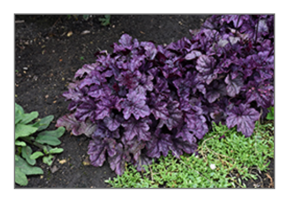
Dolce Wildberry Coral Bells

Large, scalloped, and extremely glossy leaves are deep purple with dark gray veins; dark stems hold white flowers with rosy-pink calyxes; amazing contrast to other plants; great versatility; keep soil moist in heat of summer