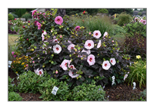
Summerific Perfect Storm Hibiscus in bloom