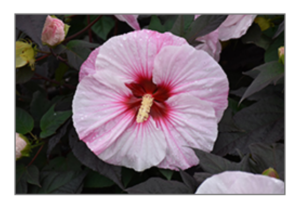
Summerific Perfect Storm Hibiscus flowers

Summerific Perfect Storm Hibiscus features bold pink round flowers with white overtones and red eyes at the ends of the stems from mid summer to early fall. Its attractive large glossy oval leaves remain black in colour throughout the season.