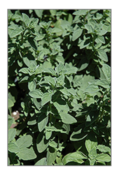
Italian Oregano foliage

This variety is noted for its lovely, mild flavour and aroma; does well in sandy loam, good heat and drought tolerance; a perfect addition to the herb garden, and is also great for containers