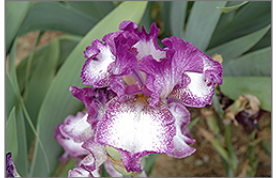
Mariposa Autumn Iris flowers

Mariposa Autumn Iris is recommended for the following landscape applications;