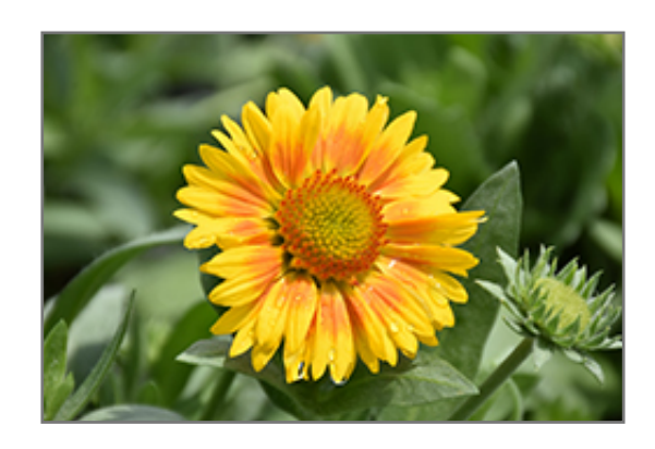
Arizona Apricot Blanket Flower flowers