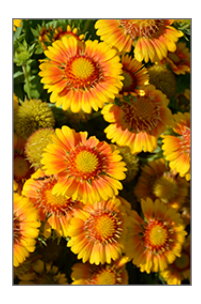
Arizona Apricot Blanket Flower flowers

Arizona Apricot Blanket Flower is a dense herbaceous perennial with a mounded form. Its relatively fine texture sets it apart from other garden plants with less refined foliage.