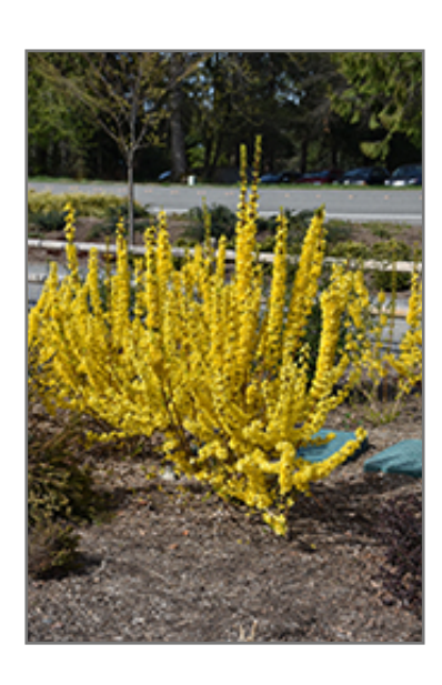
Show Off Starlet Forsythia

Show Off Starlet Forsythia is recommended for the following landscape applications;