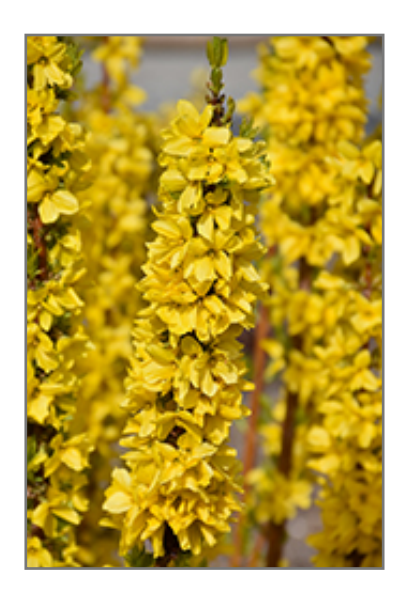
Show Off Starlet Forsythia