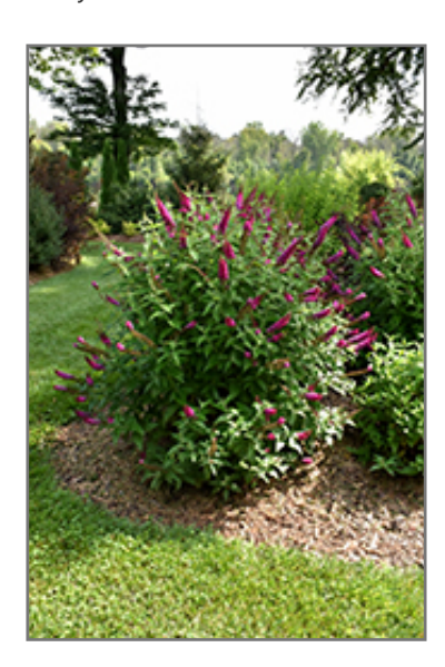
Miss Molly Butterfly Bush in bloom