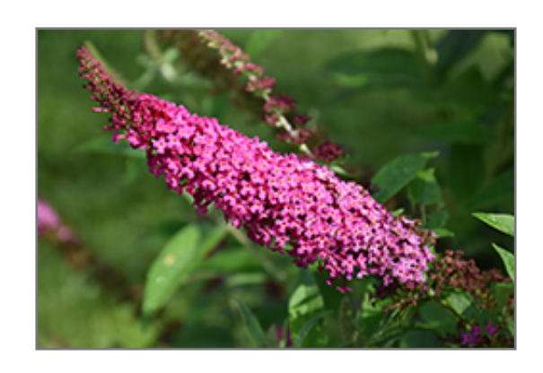
Miss Molly Butterfly Bush flowers

This is a relatively low maintenance shrub, and is best pruned in late winter once the threat of extreme cold has passed. It is a good choice for attracting bees, butterflies and hummingbirds to your yard, but is not particularly attractive to deer who tend to leave it alone in favor of tastier treats. It has no significant negative characteristics.