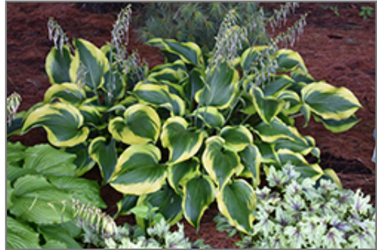
Atlantis Hosta

Atlantis Hosta is recommended for the following landscape applications;