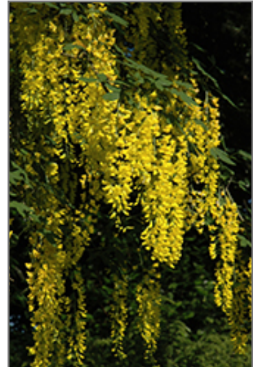
Weeping Laburnum flowers

This is a relatively low maintenance tree, and should only be pruned after flowering to avoid removing any of the current season's flowers. It is a good choice for attracting hummingbirds to your yard. Gardeners should be aware of the following characteristic(s) that may warrant special consideration;