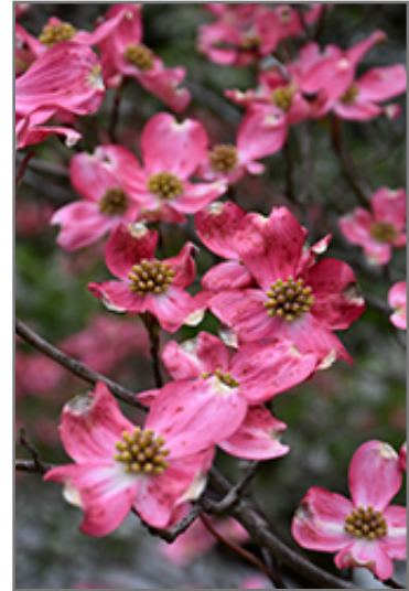
Cherokee Chief Flowering Dogwood flowers

This is a relatively low maintenance tree, and usually looks its best without pruning, although it will tolerate pruning. It is a good choice for attracting birds to your yard. Gardeners should be aware of the following characteristic(s) that may warrant special consideration;