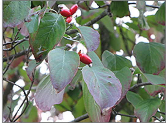
Cherokee Chief Flowering Dogwood fruit

This plant is not reliably hardy in our region, and certain restrictions may apply; contact the store for more information.