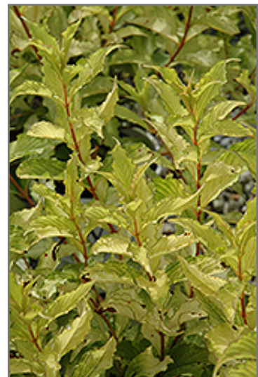
Ghost Weigela foliage