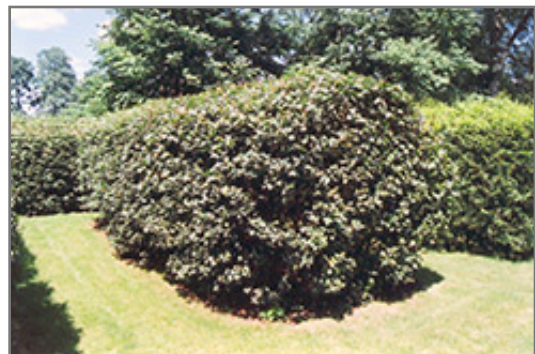
Hedge Maple