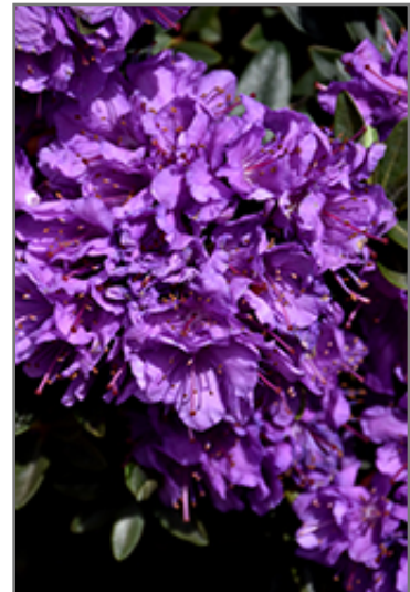
Purple Gem Rhododendron flowers

Purple Gem Rhododendron is recommended for the following landscape applications;