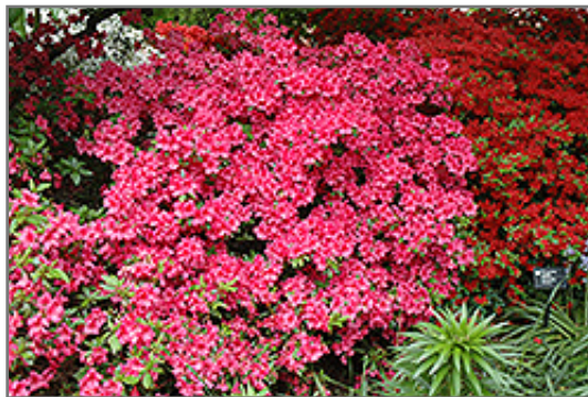
Girard's Rose Azalea in bloom