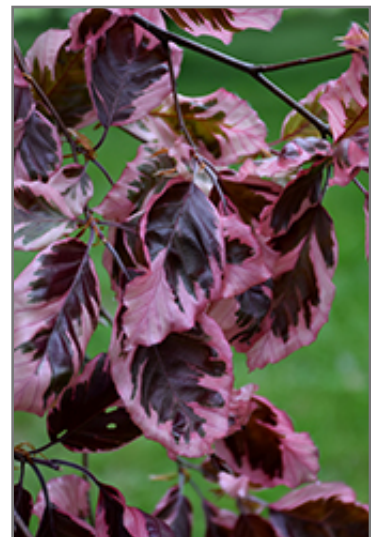
Tricolor Beech foliage