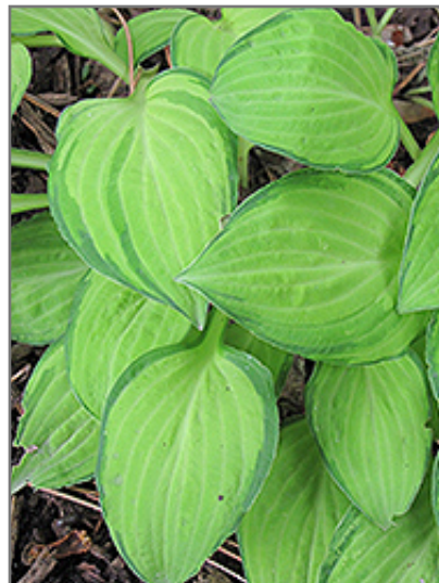
Emerald Tiara Hosta foliage