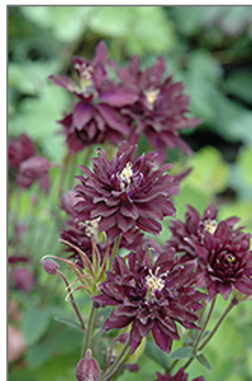
Clementine Dark Purple Columbine flowers