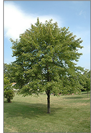
Northfire Red Maple

Northfire Red Maple is recommended for the following landscape applications;