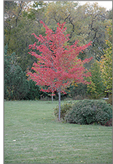
Northfire Red Maple in fall

* This is a 'special order' plant - contact store for details