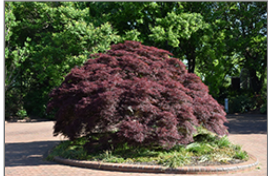
Purple-Leaf Threadleaf Japanese Maple

Purple-Leaf Threadleaf Japanese Maple is recommended for the following landscape applications;