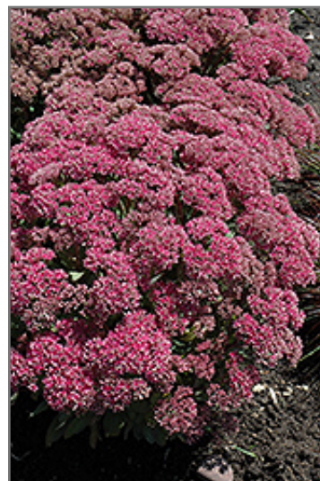
Mr. Goodbud Stonecrop flowers

Mr. Goodbud Stonecrop is recommended for the following landscape applications;