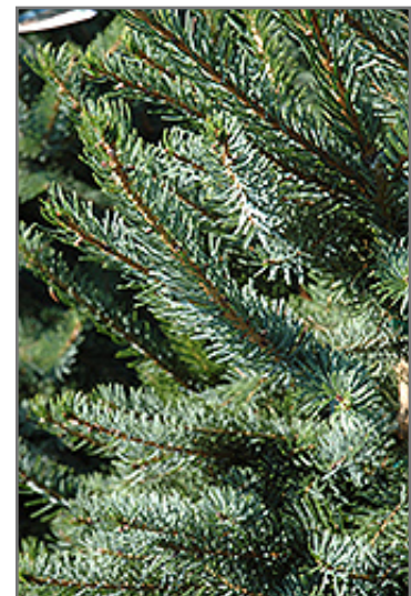
Bruns Spruce foliage