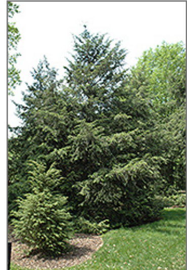
Canadian Hemlock

Canadian Hemlock is recommended for the following landscape applications;