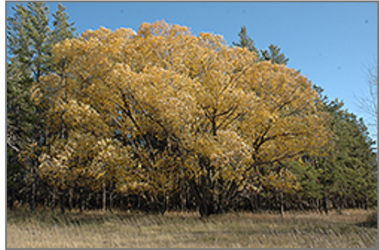
White Willow in fall

White Willow is recommended for the following landscape applications;