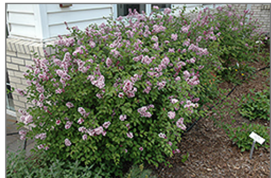
Prince Charming Lilac in bloom