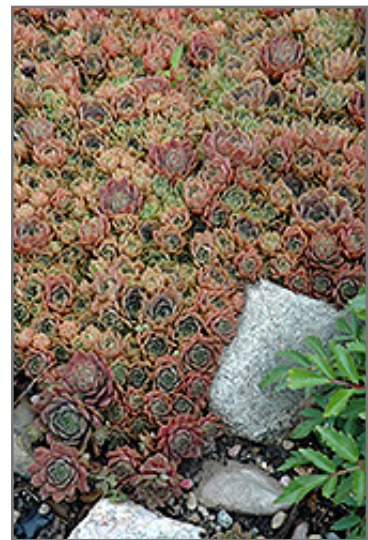
Silverine Hens And Chicks