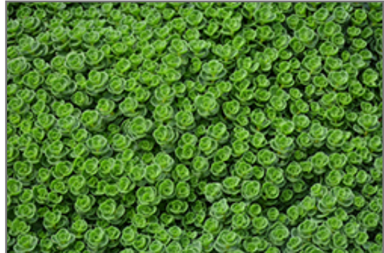
John Creech Stonecrop foliage

John Creech Stonecrop is a fine choice for the garden, but it is also a good selection for planting in outdoor pots and containers. Because of its spreading habit of growth, it is ideally suited for use as a 'spiller' in the 'spiller-thriller-filler' container combination; plant it near the edges where it can spill gracefully over the pot. Note that when growing plants in outdoor containers and baskets, they may require more frequent waterings than they would in the yard or garden.