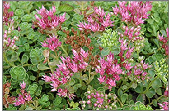
John Creech Stonecrop flowers

John Creech Stonecrop is recommended for the following landscape applications;