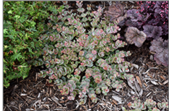
October Daphne

October Daphne is recommended for the following landscape applications;