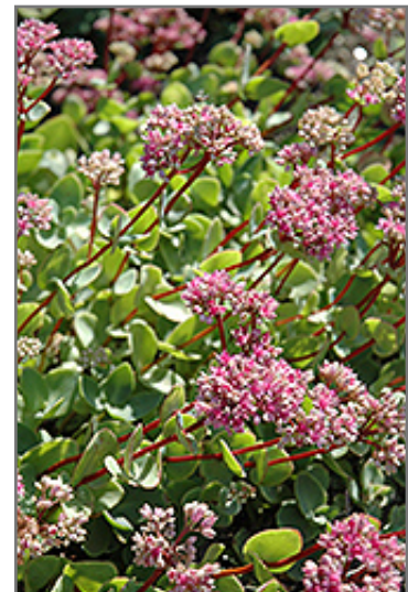
October Daphne flowers