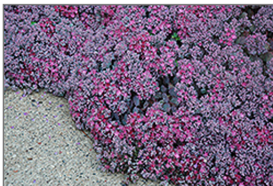
Lidakense Stonecrop in bloom