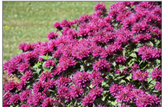
Grand Marshall Beebalm flowers