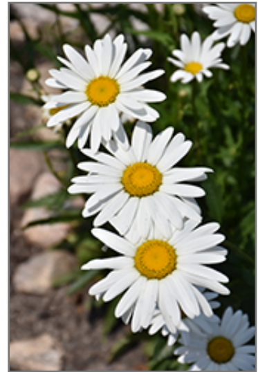
Silver Princess Shasta Daisy flowers