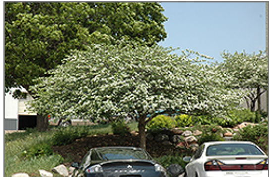
Thornless Cockspur Hawthorn in bloom