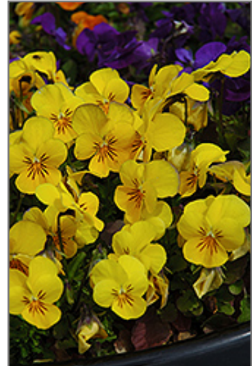
Penny Yellow Pansy flowers

This plant will require occasional maintenance and upkeep, and should only be pruned after flowering to avoid removing any of the current season's flowers. Deer don't particularly care for this plant and will usually leave it alone in favor of tastier treats. Gardeners should be aware of the following characteristic(s) that may warrant special consideration;