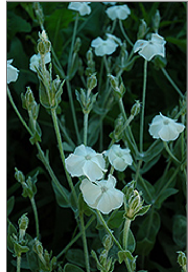
White Rose Campion flowers