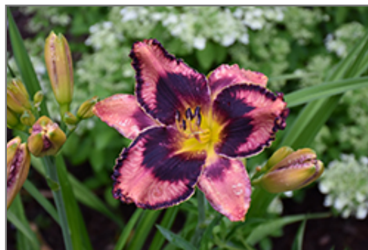
Rainbow Rhythm Storm Shelter Daylily flowers