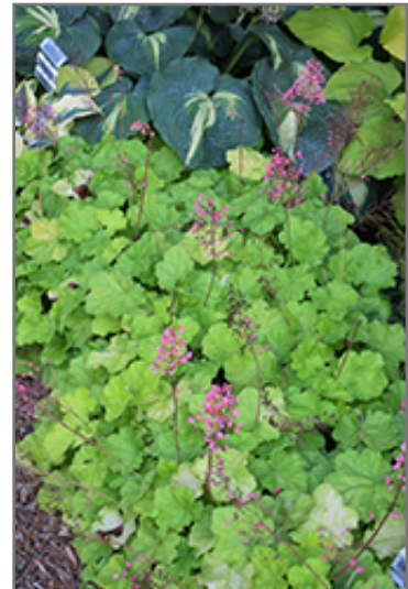
Primo Pretty Pistachio Coral Bells in bloom

This is a relatively low maintenance plant, and should be cut back in late fall in preparation for winter. It is a good choice for attracting butterflies and hummingbirds to your yard. It has no significant negative characteristics.