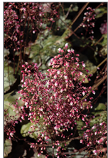
Frosted Violet Coral Bells flowers