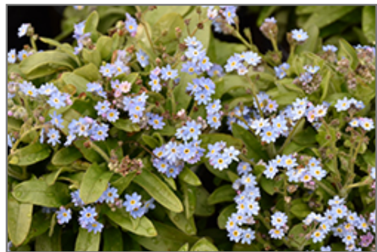
Victoria Blue Forget-Me-Not flowers