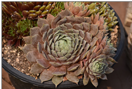
Chick Charms Berry Blues Hens And Chicks