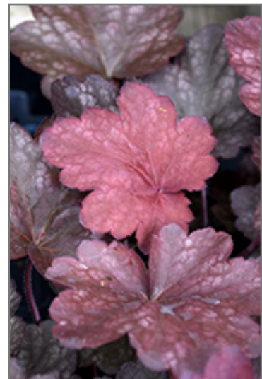
Carnival Candy Apple Coral Bells foliage