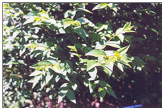
Common Privet foliage