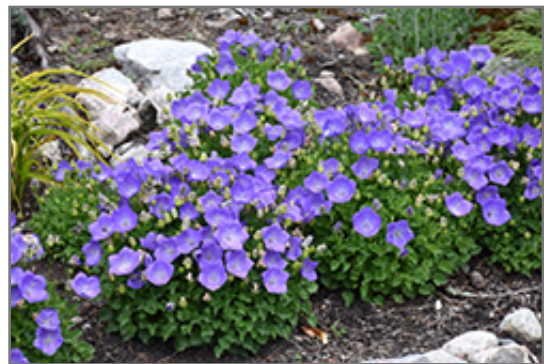
Rapido Blue Bellflower in bloom