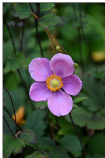
Lucky Charm Anemone flowers