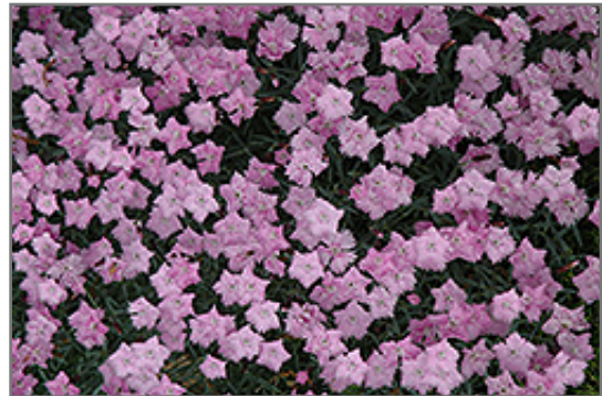
Bath's Pink Pinks in bloom

Bath's Pink Pinks is recommended for the following landscape applications;