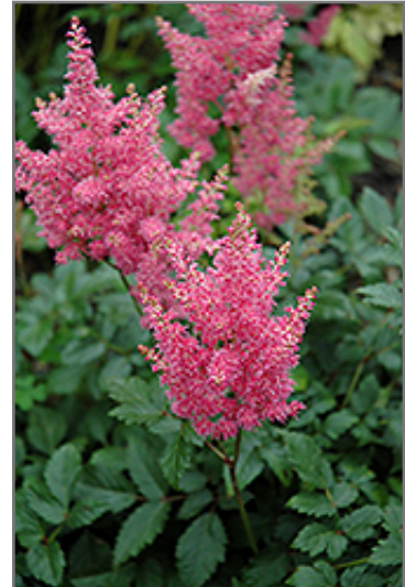
Rheinland Astilbe flowers

Rheinland Astilbe is recommended for the following landscape applications;