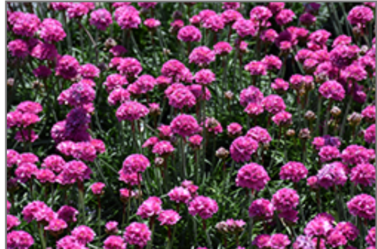
Dusseldorf Pride Sea Thrift flowers

Dusseldorf Pride Sea Thrift will grow to be only 6 inches tall at maturity extending to 8 inches tall with the flowers, with a spread of 8 inches. Its foliage tends to remain low and dense right to the ground. It grows at a slow rate, and under ideal conditions can be expected to live for approximately 10 years. As an evergreen perennial, this plant will typically keep its form and foliage year-round.