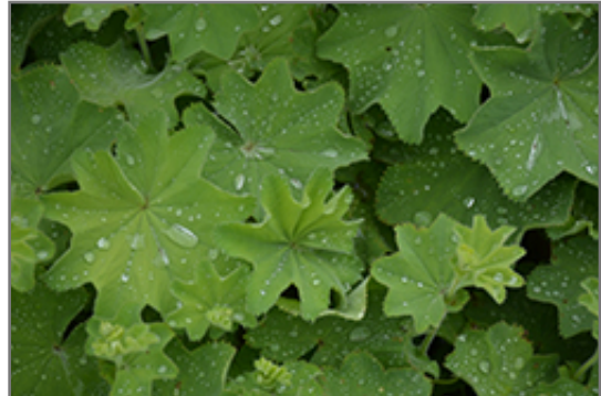
Lady's Mantle foliage

This plant performs well in both full sun and full shade. It is very adaptable to both dry and moist locations, and should do just fine under typical garden conditions. It is not particular as to soil type or pH. It is highly tolerant of urban pollution and will even thrive in inner city environments. This species is not originally from North America. It can be propagated by cuttings.